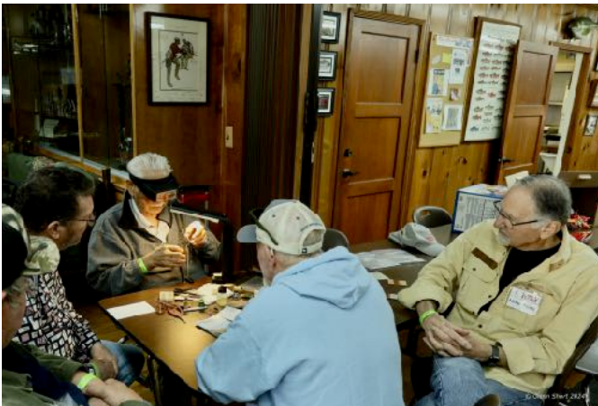
(Mas @ FlyBuy)